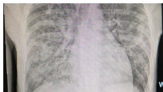
Figure 1. Chest X-ray of the patient at the time care was initiated.

Radiographic images showed diffuse interstitial involvement, alveolar opacities in the middle lung fields and at the right base, as well as an enlarged heart area (Figure 1).